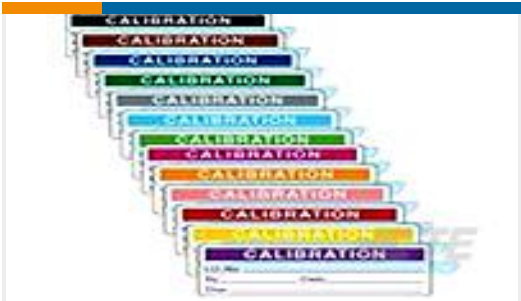
TE Part #1878661-4 QCC306LG