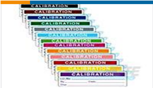
TE Part #1878661-2 QCC306GY