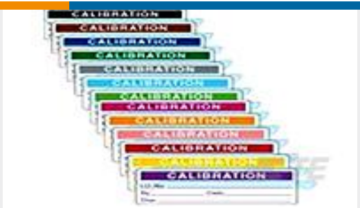
TE Part #1878661-5 QCC306MG