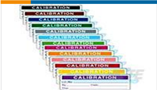
TE Part #1878661-7 QCC306PK