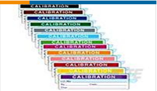
TE Part #1878661-6 QCC306OR