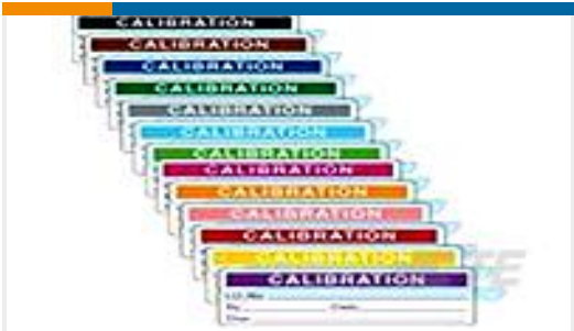
TE Part #1878661-2 QCC306GY