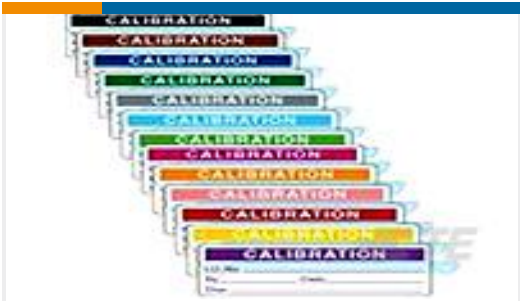
TE Part #1878660-8 QCC306BR