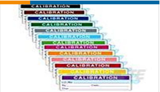
TE Part #1878661-5 QCC306MG