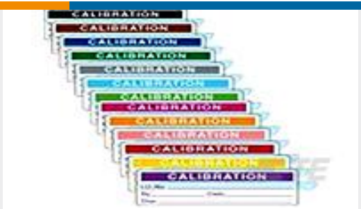
TE Part #1878661-4 QCC306LG