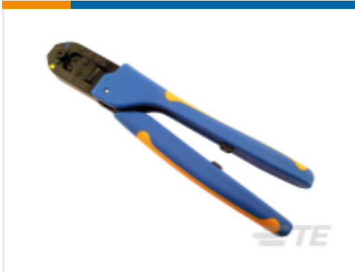
TE Part #2280977-1 CCII UNML PIN SOCKET 26-24 ASSY