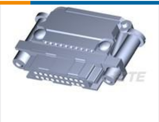
TE Part #A82239-000 MTCPOKT1P2SGAD