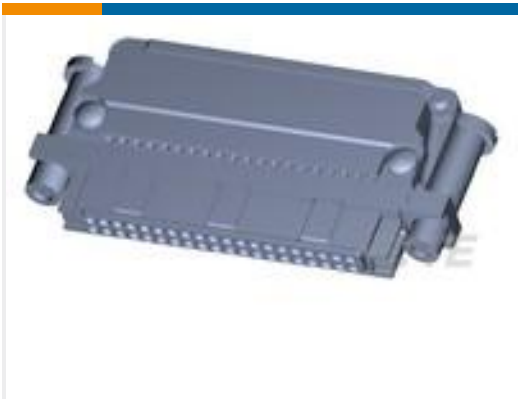
TE Part #C26534-000 MTCPOKT2P26SGBB

Product Drawings 3SBC1668A2=M39016/38-008L English