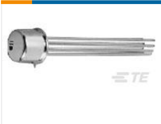
TE Part #9-1617350-8 J1MAP-12XM=M39016/7-020M