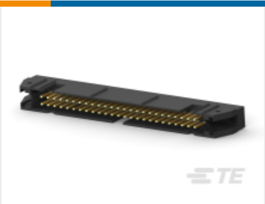
TE Part #102160-3 AMP-LATCH UNIVERSAL HEADERS