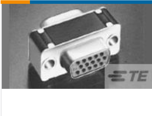
TE Part #212559-1 CONN SAVER,9 POSN,AMPLIMITE