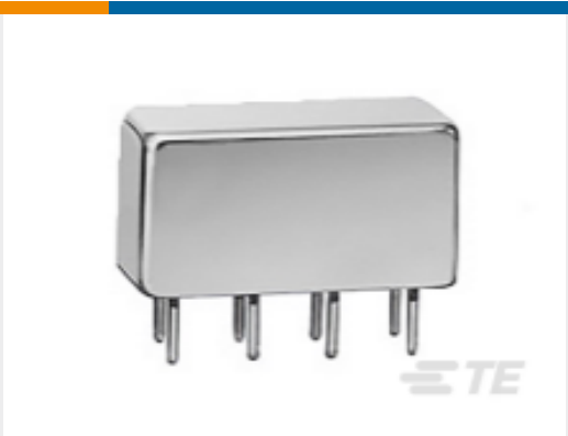
TE Part #1617039-3 HMS1130S02L = M39016/44-010L