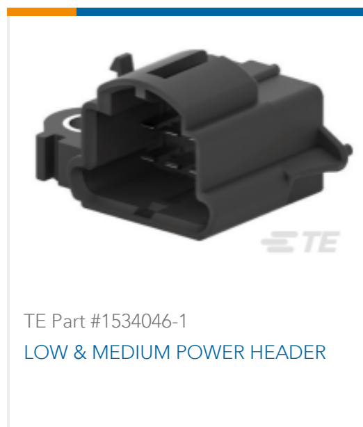
TE Part #1534046-1 LOW & MEDIUM POWER HEADER