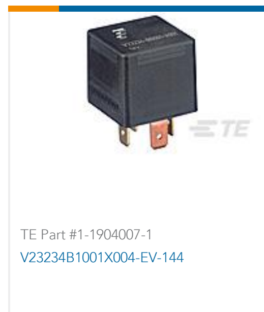
TE Part #1-1904007-1 V23234B1001X004-EV-144