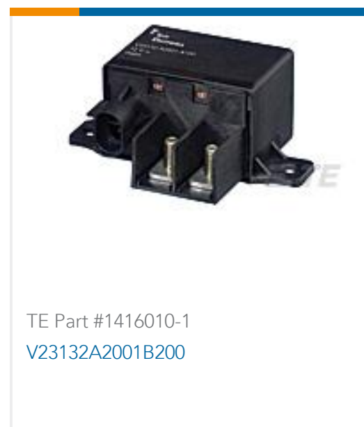
TE Part #1416010-1 V23132A2001B200