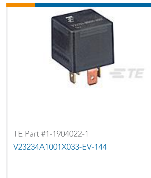
TE Part #1-1904022-1 V23234A1001X033-EV-144