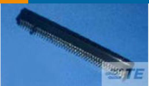
TE Part #2-1734774-1 PCI EXP 3.1L 98 POS WHT 30u"