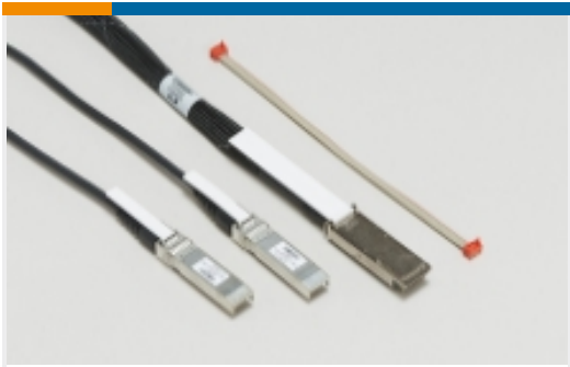
Pluggable I/O Cable Assemblies(84)