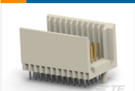
TE Part #2170872-1 Hard Metric Male Connector: Traditional Backplane, Mezzanine, 2mm