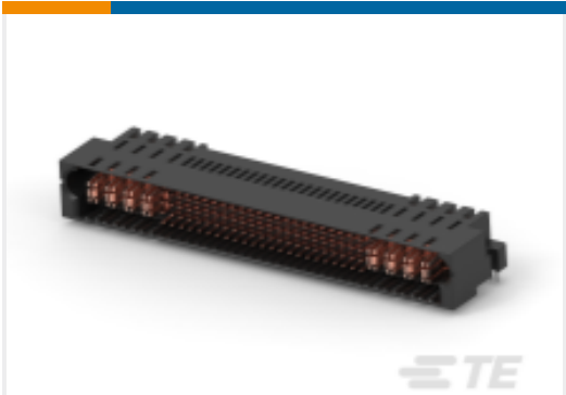
TE Part #2-2204910-5 MBXLE R/A HEADER 4HDP + 92S + 4HDP