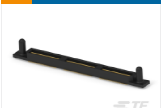
TE Part #2-1658063-3 MSB0.80PL5ASY120FL,-,10,-TY