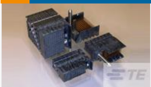
TE Part #2132423-1 IMP100O,R,RA3P6C,RG,39