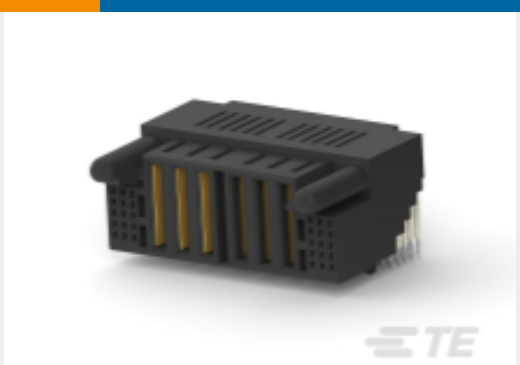
TE Part #2204400-4 MULTI-BEAM HD R/A REC. 15S+3P+3P+15S