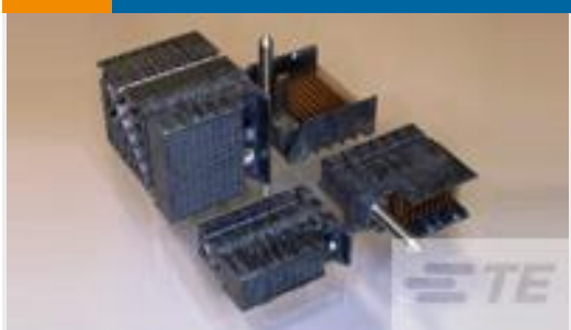
TE Part #2007850-1 IMP100S,H,V5P10C,UG,DEW46,4.5