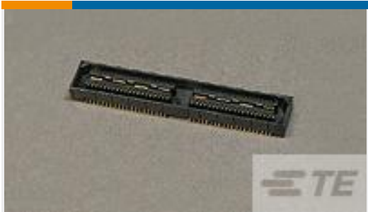
TE Part #6-1658043-2 MSB0.80RC-ASY080FL,GP,F,-TR