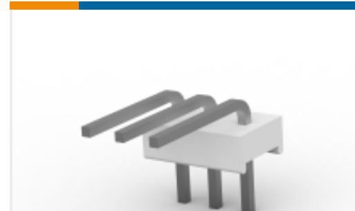
TE Part #640457-2 Polyester Right Angle PCB Header: 2.54mm, Unshrouded, MTA 100