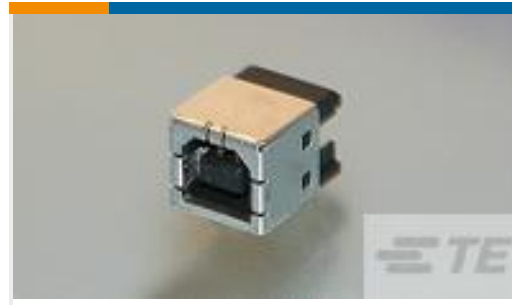
TE Part #1734346-1 STD USB TYPE B, R/A, SMT