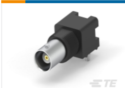
TE Part #227161-7 BNC Right Angle M Jack RF Connector, 50 Ohm, Bayonet Coupling Mechanism