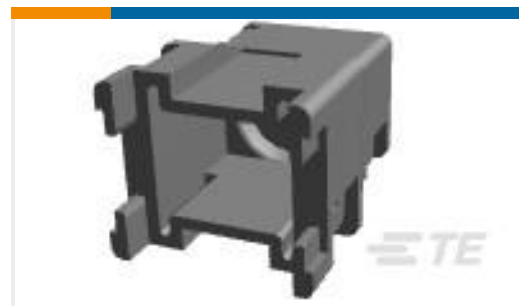
TE Part #207602-1 METRIMATE,STR REL KIT,12P