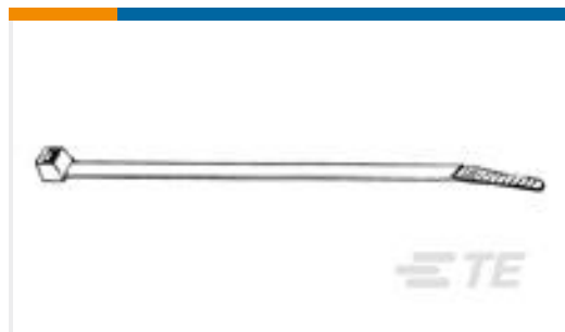
TE Part #1-604772-0 CABLE TIE, 8" L, BLACK, 100PK