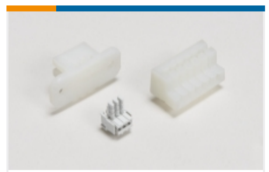
Card Edge Connector Housings(1)