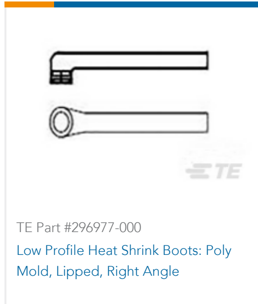
TE Part #296977-000 Low Profile Heat Shrink Boots: Poly Mold, Lipped, Right Angle