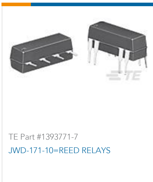
TE Part #1393771-7 JWD-171-10=REED RELAYS