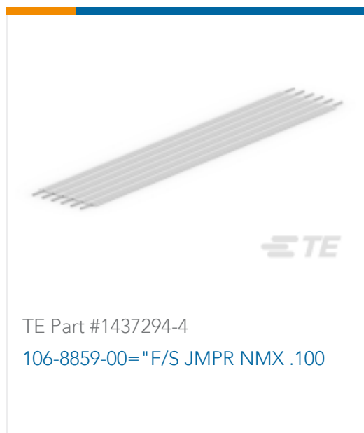
TE Part #1437294-4 106-8859-00="F/S JMPR NMX .100