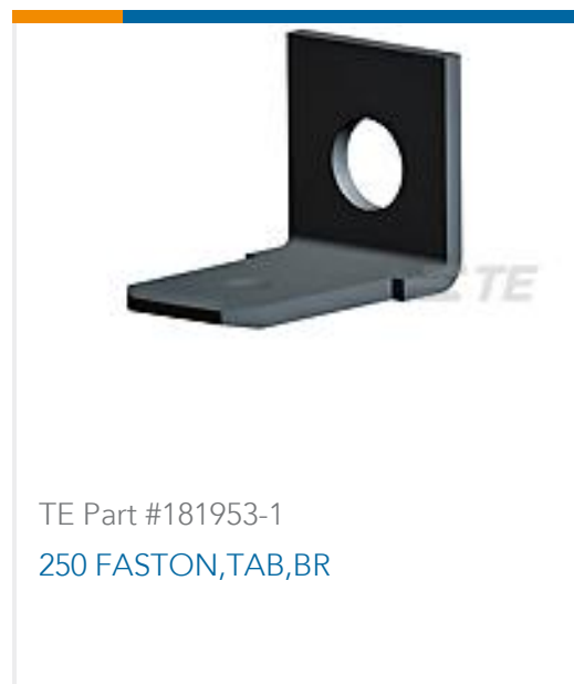
TE Part #181953-1 250 FASTON, TAB, BR