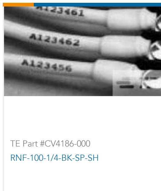
TE Part #CV4186-000 RNF-100-1/4-BK-SP-SH