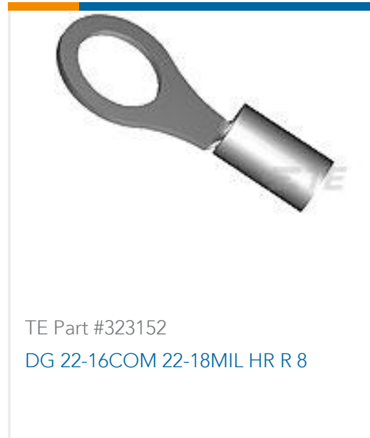
TE Part #323152 DG 22-16COM 22-18MIL HR R 8