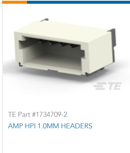
TE Part #1734709-2 AMP HPI 1.0MM HEADERS