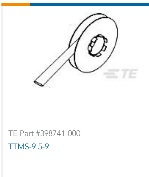
TE Part #398741-000 TMS-9.5-9