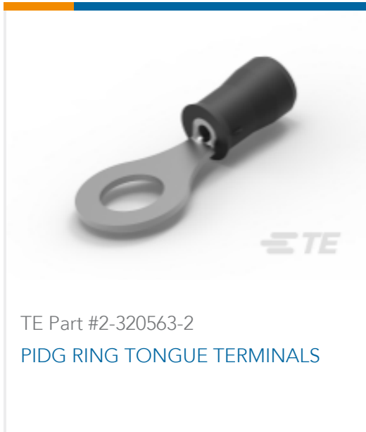
TE Part #2-320563-2 PIDG RING TONGUE TERMINALS