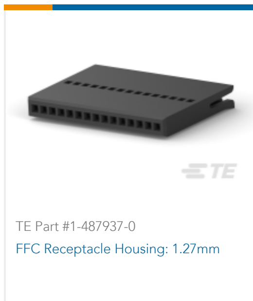
TE Part #1-487937-0 FFC Receptacle Housing: 1.27mm