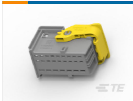
TE Part #1-1718484-4 AMP MCP BACKSHELLS