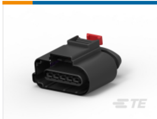
TE Part #1-1718624-1 AMP MCP, SEALED CONNECTOR HOUSING