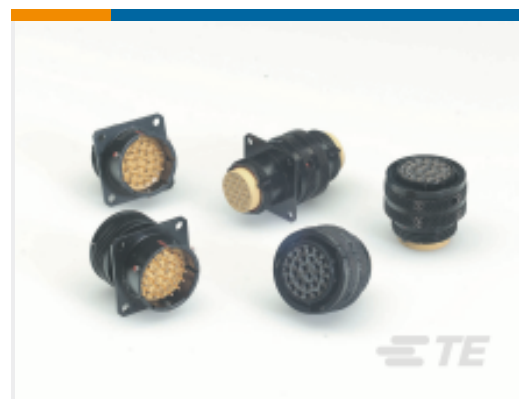
TE Part #ZPF00000000018132 FDPA 50-14-19 PN-K-A5610