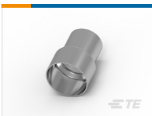
TE Part #2141810-2 SHIELDING SLEEVE