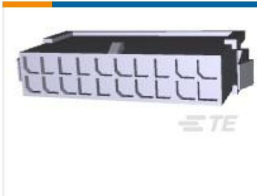
TE Part #2-794615-0 PANEL MT DBL ROW HSG 20 POS