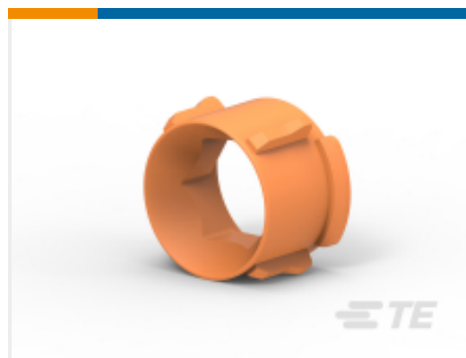
TE Part #2177526-2 CABLE INSERT TOOL,25qmm