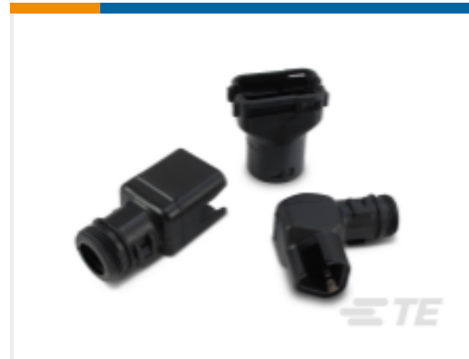
TE Part #1011-331-0205 DEUTSCH DT BACKSHELLS