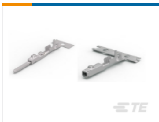
TE Part #1452503-2 MCON, RECEPTACLE AND TAB