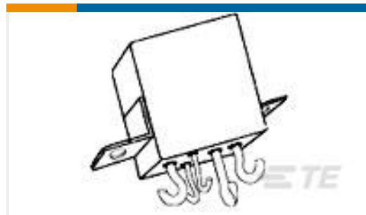
TE Part #5-1617791-4 FCA-125-3705L=M83536/37-005L