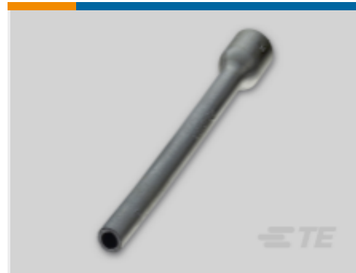
TE Part #096673-000 Low Profile Heat Shrink Boots: Poly Molded, Lipped, Straight