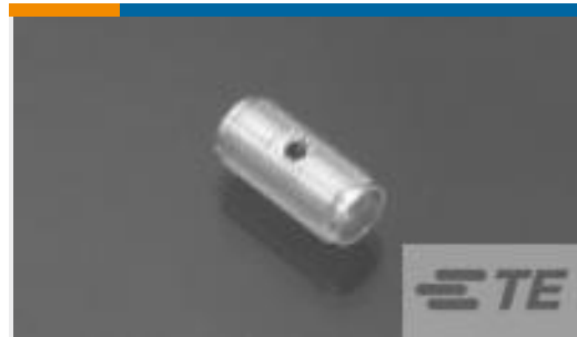
TE Part #1053489-1 2080 0000 02