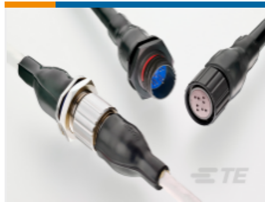
TE Part #2102353-3 CeeLok FAS-T, Plug Kit, Ni, A