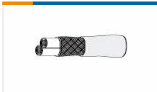
TE Part #169311-000 55A1822-24-9/96-9CS2275