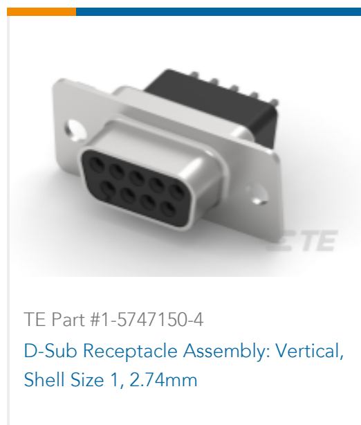
TE Part #1-5747150-4 D-Sub Receptacle Assembly: Vertical, Shell Size 1, 2.74mm