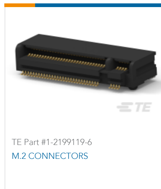
TE Part #1-2199119-6 M.2 CONNECTORS