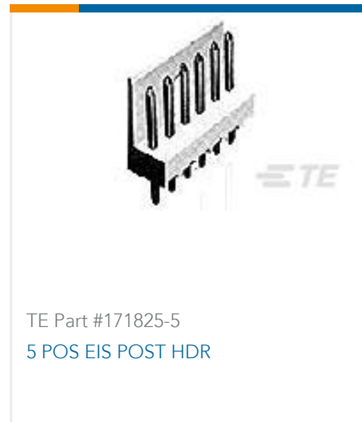
TE Part #171825-5 5 POS EIS POST HDR