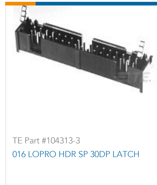
TE Part #104313-3 016 LOPRO HDR SP 30DP LATCH