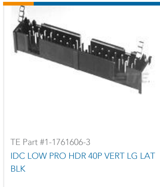
TE Part #1-1761606-3 IDC LOW PRO HDR 40P VERT LG LAT BLK