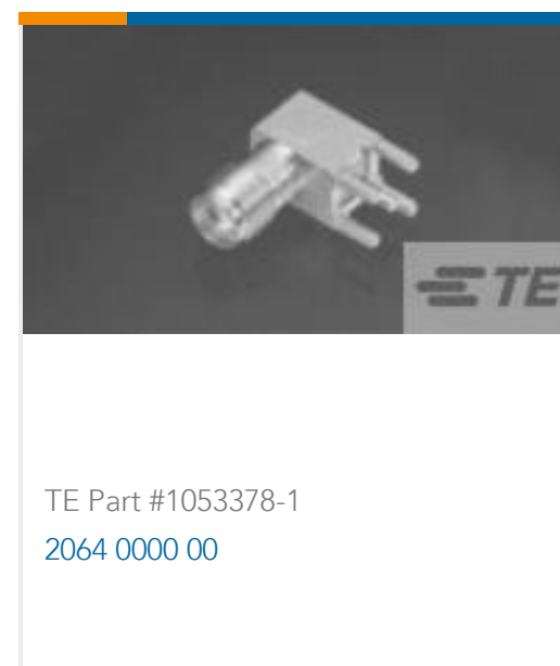
TE Part #1053378-1 2064 0000 00