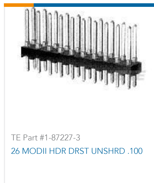
TE Part #1-87227-3 26 MODII HDR DRST UNSHRD .100