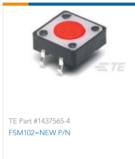
TE Part #1437565-4 FSM102=NEW P/N