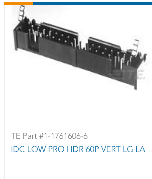
TE Part #1-1761606-6 IDC LOW PRO HDR 60P VERT LG LA