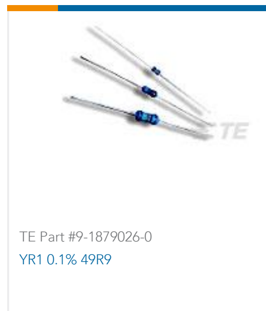
TE Part #9-1879026-0 YR1 0.1% 49R9