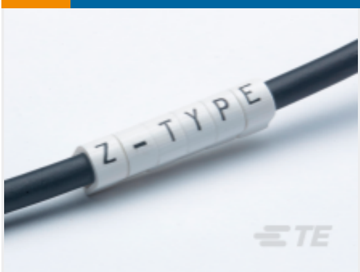
TE Part #EC0581-000 06161808