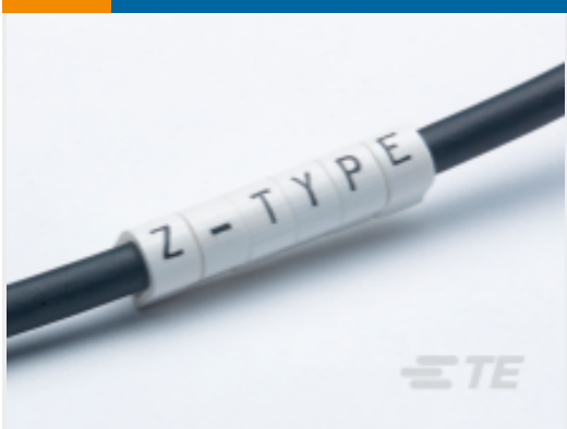
TE Part #EC0577-000 Z-TYPE PUSH-ON MARKERS