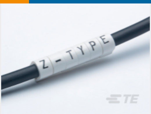
TE Part #EC0578-000 06161505