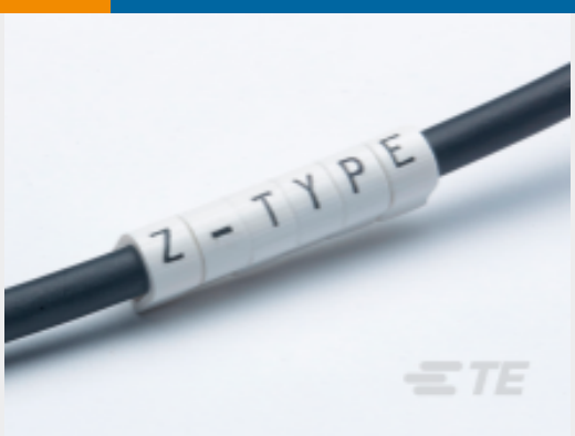
TE Part #EC0573-000 06161202