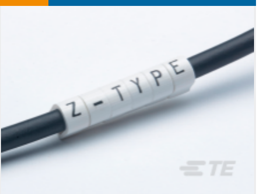
TE Part #EC0572-000 06161101