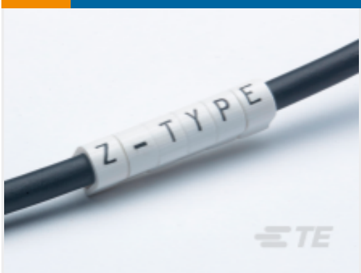
TE Part #EC0575-000 06161303