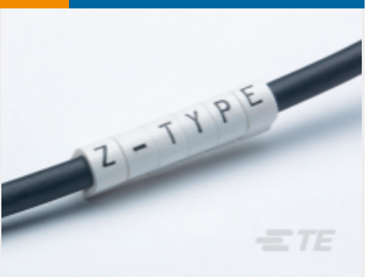
TE Part #EC0580-000 06161707