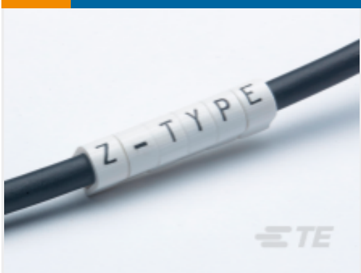
TE Part #EC0579-000 06161606