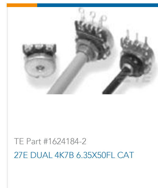
TE Part #1624184-2 27E DUAL 4K7B 6.35X50FL CAT