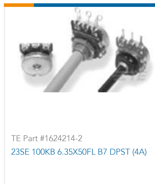
TE Part #1624214-2 23SE 100KB 6.35X50FL B7 DPST (4A)