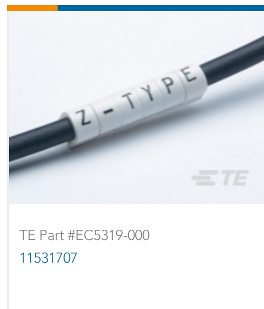
TE Part #EC5319-000 11531707