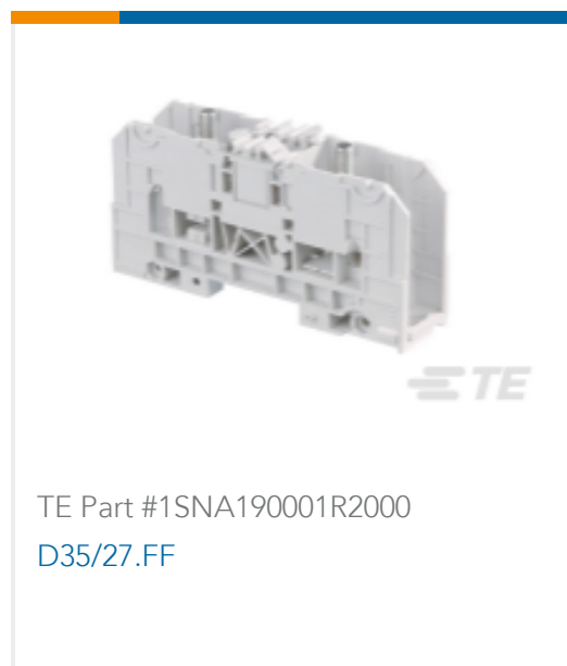
TE Part #1SNA190001R2000 D35/27.FF