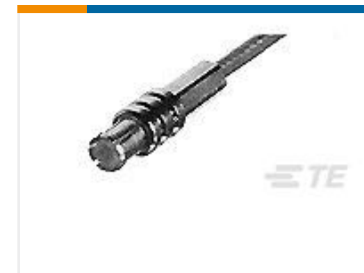
TE Part #1060875-2 MCX CABLE PLUG, CRIMP ATTACH