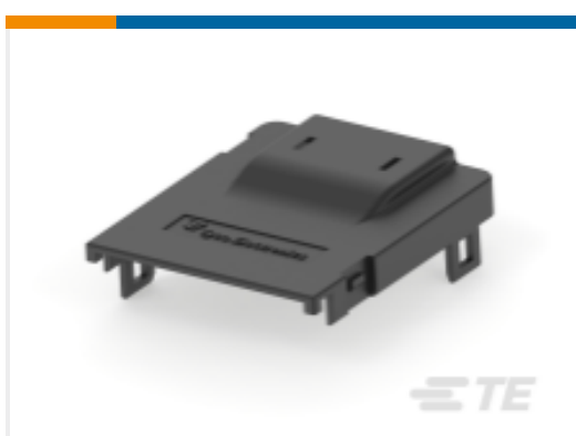
TE Part #1986186-1 Strain Relief, 20 Posn, D3000 Dynamic, 2