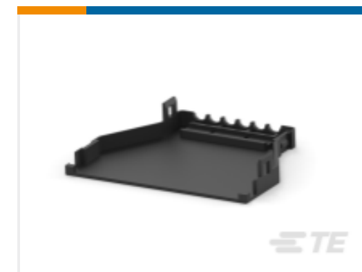
TE Part #1776695-1 Strain Relief, D5200, Dynamic