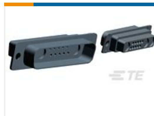
TE Part #208810-2 PLUG ASSY, COAX MIX, AMPLIMITE