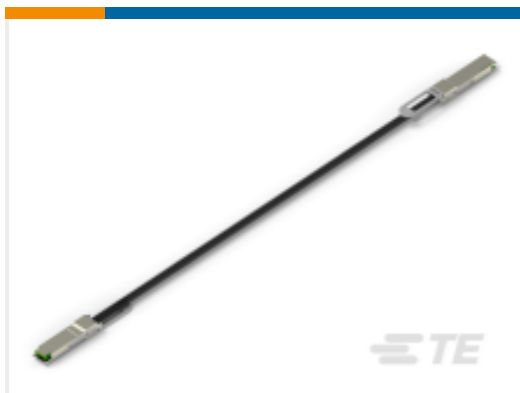
TE Part #2333393-3 QSPF28 to QSPF28 Cable Assembly: 30 AWG