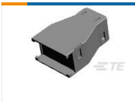
TE Part #1986185-1 Strain Relief, 6 Posn, D5200 Dynamic. 2