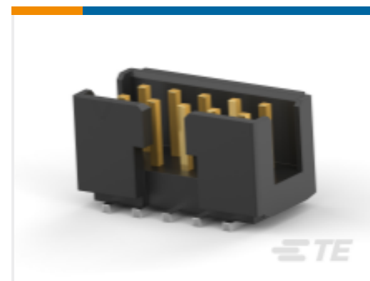
TE Part #1-2373376-0 10P, 2MM, SHRD HDR, DRVT, SMD, 0.1 AU, TB