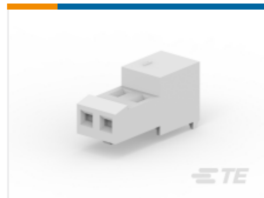
TE Part #3-644426-7 Nylon Tin Plated Receptacle: 2.54mm, No Mating Alignment, MTA 100