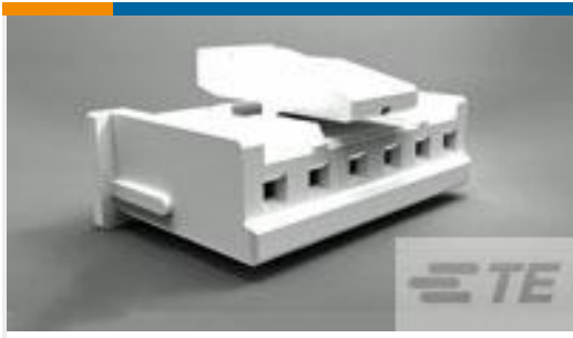
TE Part #1969442-8 EP 2.5 TPA Housing, 8 Pos