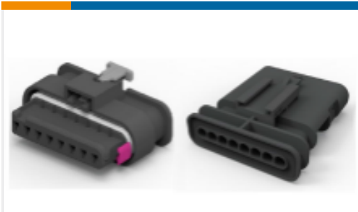
TE Part #2289523-1 MCON, CONNECTOR HOUSING