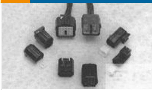
TE Part #344273-1 3 WAY REC. HSG. SIL. SEALECONO