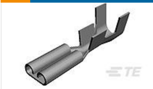
TE Part #42640-1 FASTON 250 RECEPTACLE 22-18 AWG BR