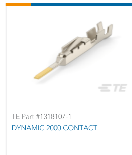
TE Part #1318107-1 DYNAMIC 2000 CONTACT