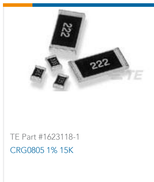
TE Part #1623118-1 CRG0805 1% 15K