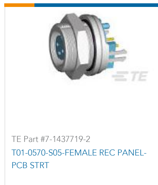
TE Part #7-1437719-2 T01-0570-S05-FEMALE REC PANEL-PCB STRT