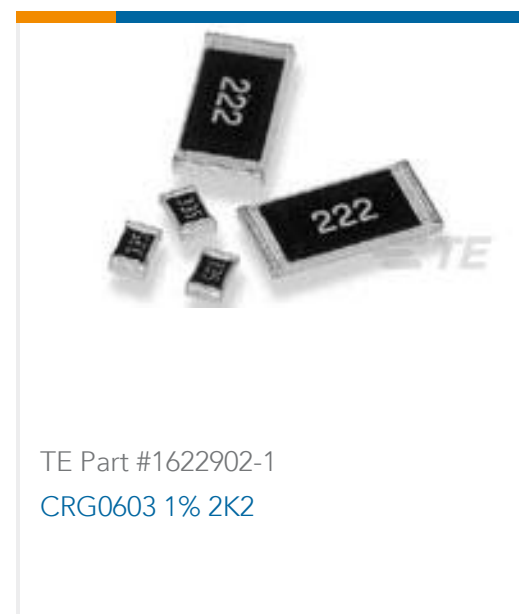
TE Part #1622902-1 CRG0603 1% 2K2