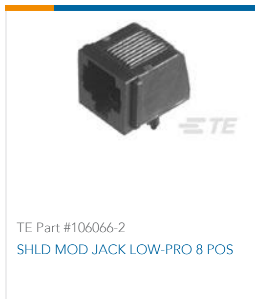
TE Part #106066-2 SHLD MOD JACK LOW-PRO 8 POS