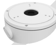
DS-1281ZJ-S Inclined Base Mount