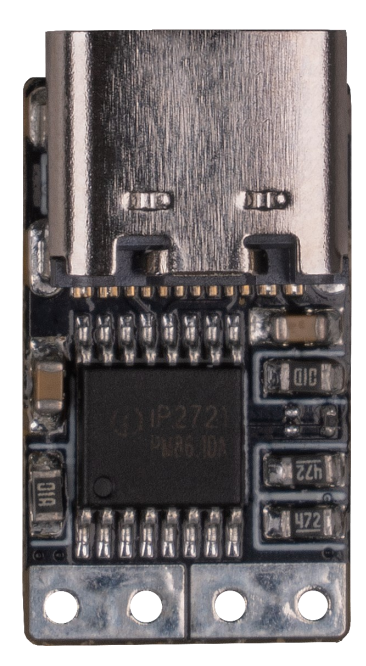
Both resistors soldered = 5 V