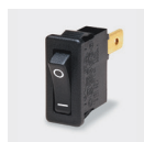
X8800VA T8800VA - - -