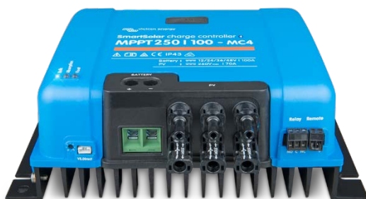
SmartSolar Charge Controller MPPT 250/100-MC4 without display