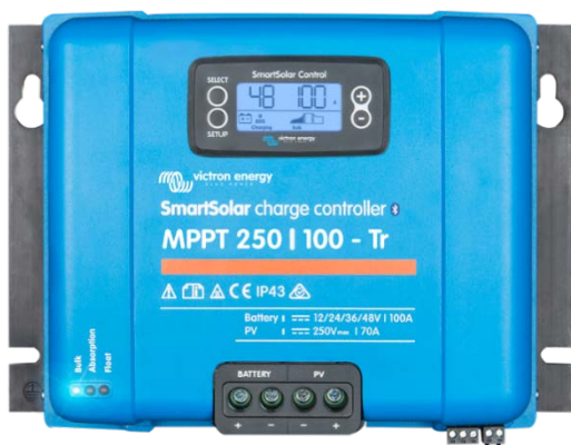
SmartSolar Charge Controller MPPT 250/100-Tr with pluggable display