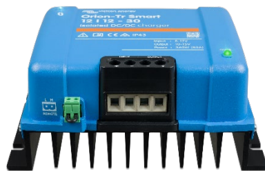
Orion-Tr Smart 12/12-30