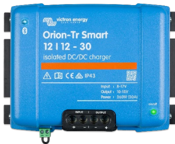
Orion-Tr Smart 12/12-30