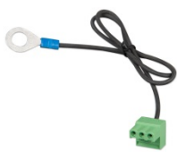
Connector with preassembled DC minus cable (included)