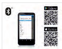
Save'n carry App