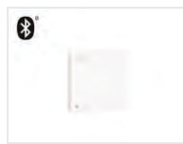
Multisensor LS 20.00 pro4