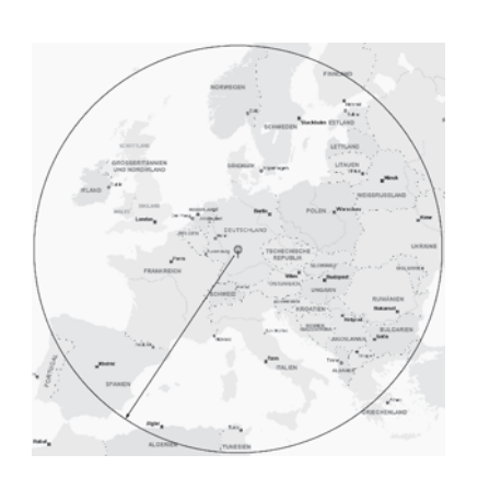
Range of the signal approx. 1500 km