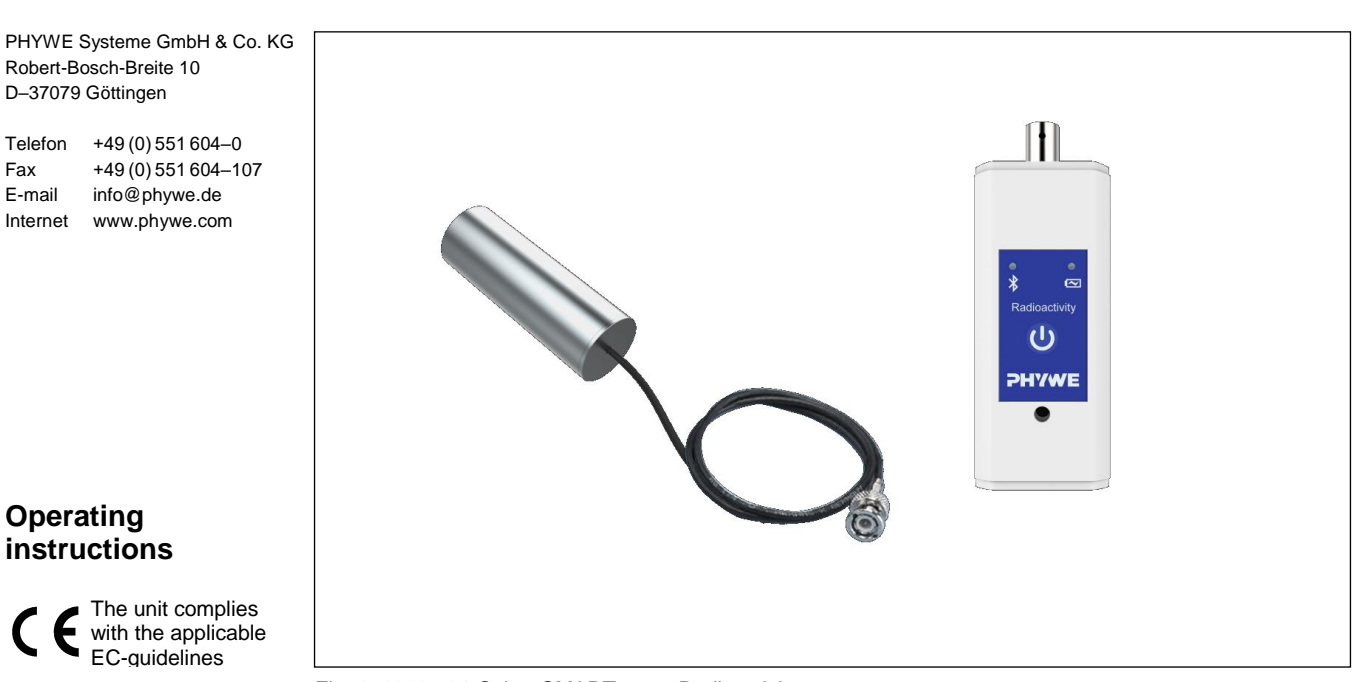
Fig. 1: 12937-01 Cobra SMARTsense Radioactivity