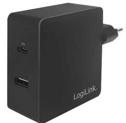
PA0213 USB-C 65W PD Port