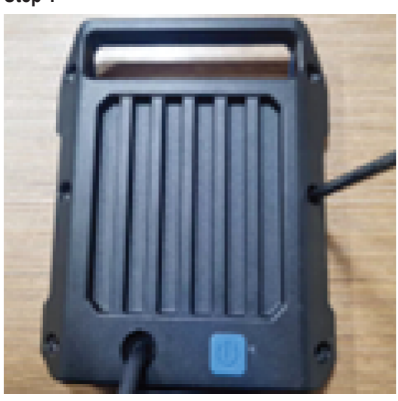
Unscrew 6x housing cover screws.