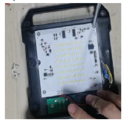
Unscrew 4x light source board screws.