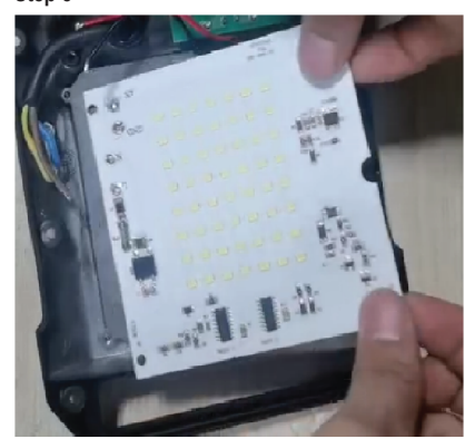
Remove the light source.

This is a publication by Conrad Electronic SE, Klaus-Conrad-Str. 1, D-92240 Hirschau (www.conrad.com).