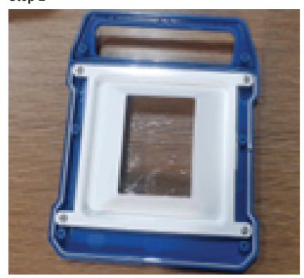
Remove the front panel.