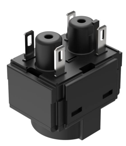
Attention: The preview is based on a sample product. This can differ from your current configuration.