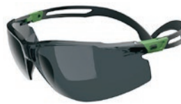
SF550ASP-GRN 7100243978 Lens: IR 5.0 Grey, AS+ Frame colour: Green and black