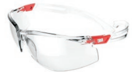
SF501SGAF-RED 7100243934 Lens: Clear, SGAF Frame colour: Clear and red