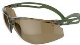
SF505SGAF-DGR 7100244022 Lens: Brown, SGAF Frame colour: Olive green