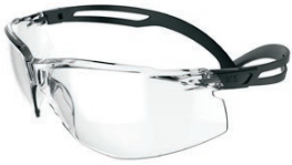
SF501ASP-BLK 7100243979 Lens: Clear, AS+ Frame colour: Black