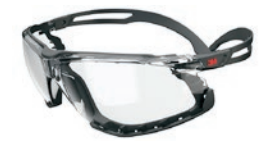
SF501SGAF-BLK-FM 7100243964 Lens: Clear, SGAF Frame colour: Black with foam gasket