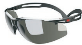
SF509AF-BLK 7100243963 Lens: Silver mirror, AS/AF Frame colour: Black