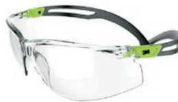
SF501SGAF-GRN 7100243971 Lens: Clear, SGAF Frame colour: Green and black