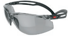
SF507SGAF-BLK 7100243995 Lens: Indoor/outdoor grey, SGAF Frame colour: Black