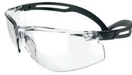
SF501AF-BLK 7100244045 Lens: Clear, AS/AF Frame colour: Black