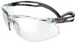
SF501SGAF-BLK 7100243142 Lens: Clear, SGAF Frame colour: Black