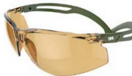
SF528SGAF-DGR 7100244062 Lens: Light brown, SGAF Frame colour: Olive green