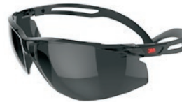
SF502SGAF-BLK 7100244201 Lens: Grey, SGAF Frame colour: Black