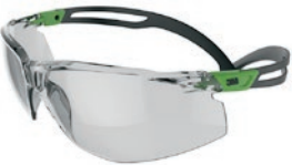
SF517ASP-GRN 7100243977 Lens: IR 1.7 Grey, AS+ Frame colour: Green and black