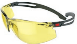
SF503SGAF-BLK 7100243980 Lens: Amber, SGAF Frame colour: Black