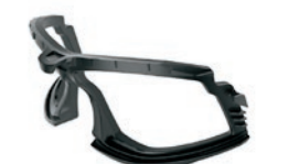
SF500-FOAM 7100243943 Foam gasket accessory

Give them a try – request a sample at 3M.co.uk/SecureFit