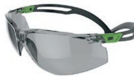
SF530ASP-GRN 7100243989 Lens: IR 3.0 Grey, AS+ Frame colour: Green and black