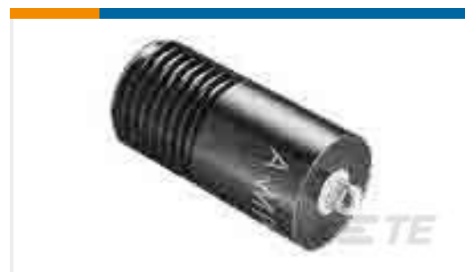
TE Part #5-830178-1 RECEPTACLE