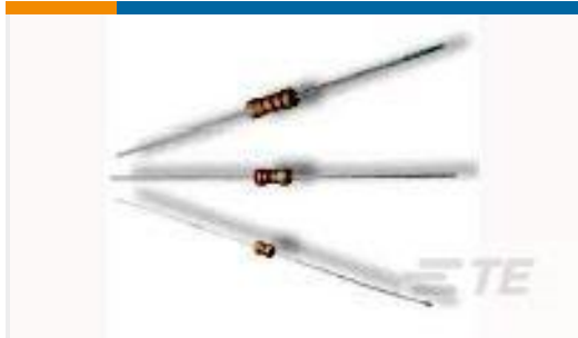
TE Part # 2-1623929-2 CFR200 5% 22K