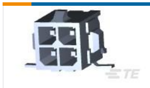
TE Part #3-794629-4 04P MICRO MNL ASSY,R/A,SMT,LF