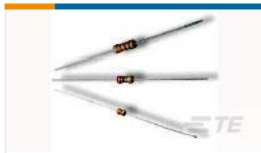
TE Part # 1623932-8 CFR50 5% 10K