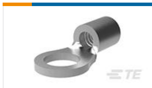
TE Part #33457 TERMINAL,SOLIS R 12-10 10