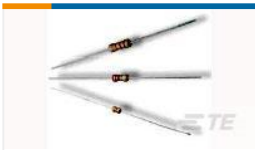
TE Part # 1623930-3 CFR25 5% 10K