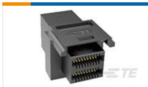
TE Part #2227580-1 1X1 R/A ASSY, MINI SAS HD INTERNAL