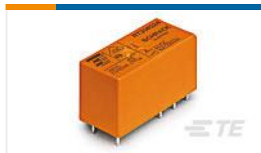
TE Part #5-1393243-6 RT424F24