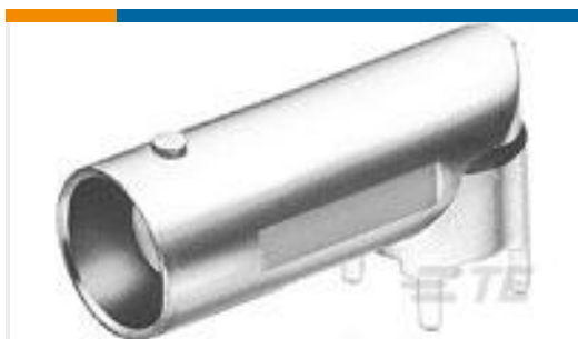
TE Part #5413631-1 JACK,RTANG, PCB,50 OHM, BNC