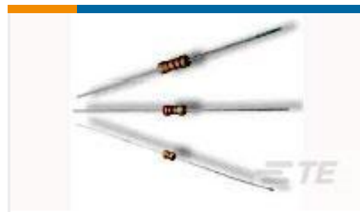
TE Part # 1623925-2 CFR100 5% 100R