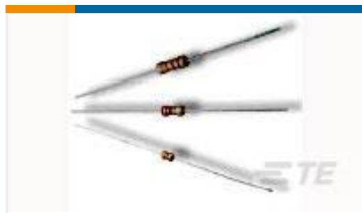
TE Part # 1623927-8 CFR16 5% 120R