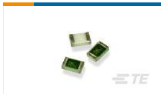
TE Part #1-1614885-8 CPF 0805 390K 0.1% 25PPM 1K RL