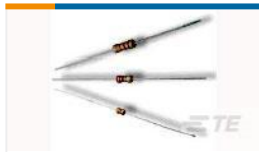
TE Part # 1623927-8 CFR16 5% 120R