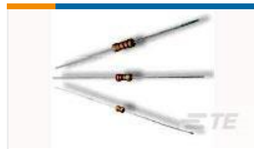
TE Part # 1623925-2 CFR100 5% 100R