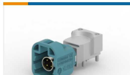
TE Part #2286546-9 HSD,HDR ASSY,90DEG,COD Z