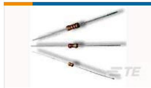
TE Part # 1623932-8 CFR50 5% 10K