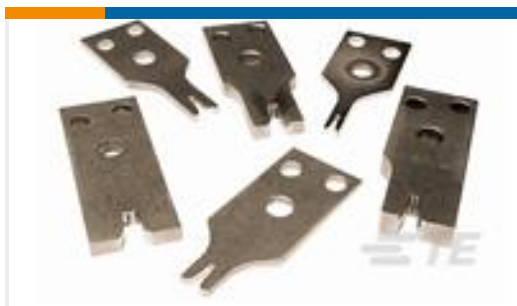
TE Part #456407-5 CRIMPER, WIRE .100 "F"