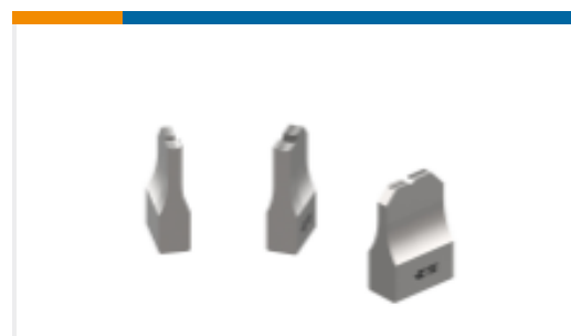
TE Part #8-1333201-8 ANVIL, COMBINATION