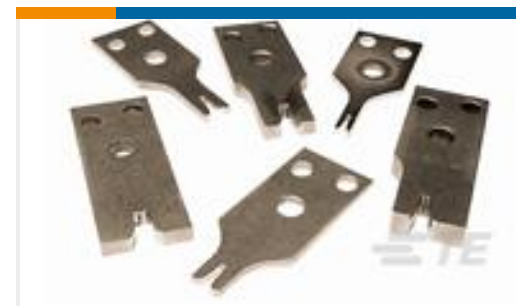
TE Part #1-456402-7 CRIMPER WIRE .055 F