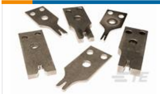
TE Part #2-1333281-7 CRIMPER, WIRE, F PREMIUM (.042")