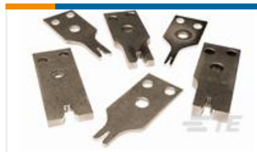
TE Part #1-456403-3 CRIMPER WIRE .062 F