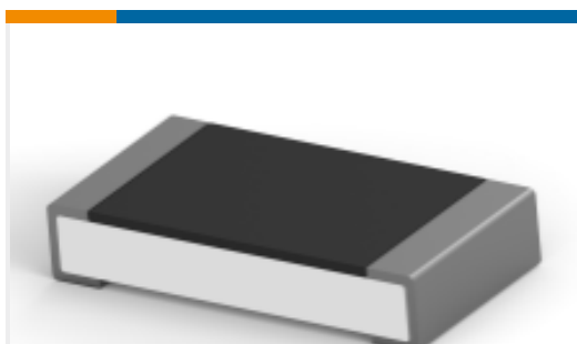
TE Part #2-2176392-9 RQ 1206 261K 0.1% 10PPM 5K RL