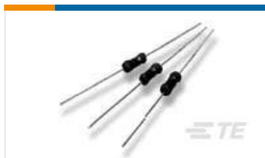
TE Part #1-1879353-9 RR02 5% 24K AMMO