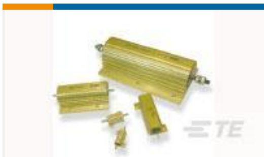
TE Part #9-1625971-5 HSA25 R01 10%