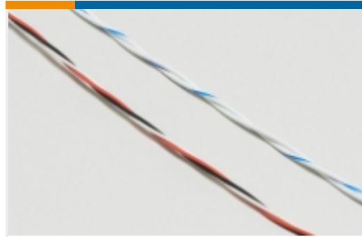
Twisted Pair Cable(1)