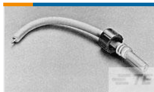
TE Part #1-830611-0 LGH 1/2 SNGL MLD END