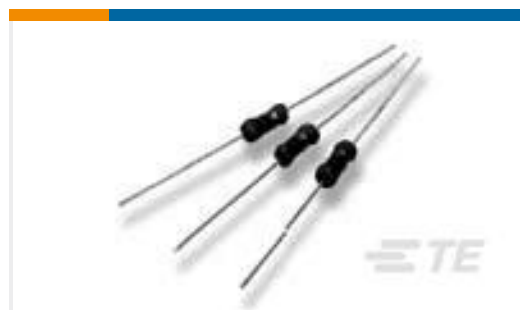
TE Part #7-1879354-5 RR03 5% 390R AMMO