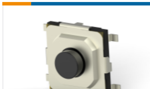
TE Part #2337238-3 TACT MINI GW 5.2X5.2X2 160GF