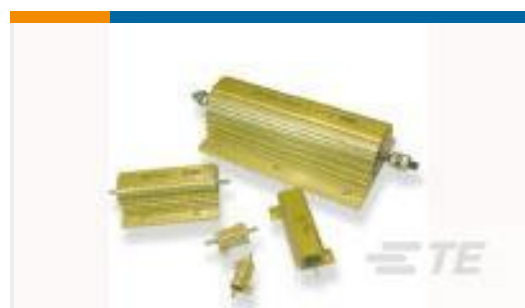
TE Part #9-1625971-5 HSA25 R01 10%