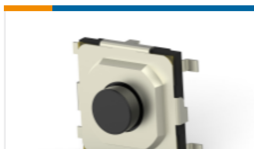
TE Part #2337238-3 TACT MINI GW 5.2X5.2X2 160GF