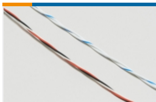
Twisted Pair Cable(1)