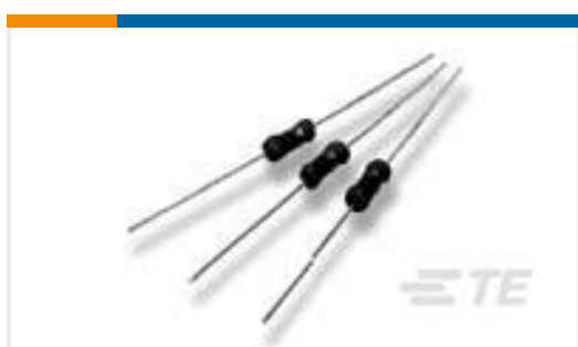
TE Part #7-1879354-5 RR03 5% 390R AMMO