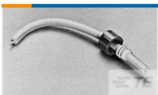
TE Part #1-830611-0 LGH 1/2 SNGL MLD END