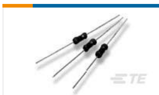
TE Part #1-1879353-9 RR02 5% 24K AMMO