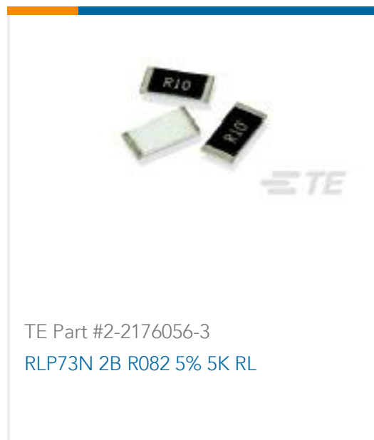
TE Part #2-2176056-3 RLP73N 2B R082 5% 5K RL