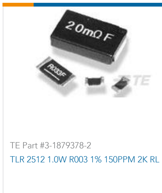
TE Part #3-1879378-2 TLR 2512 1.0W R003 1% 150PPM 2K RL