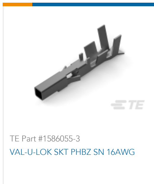
TE Part #1586055-3 VAL-U-LOK SKT PHBZ SN 16AWG