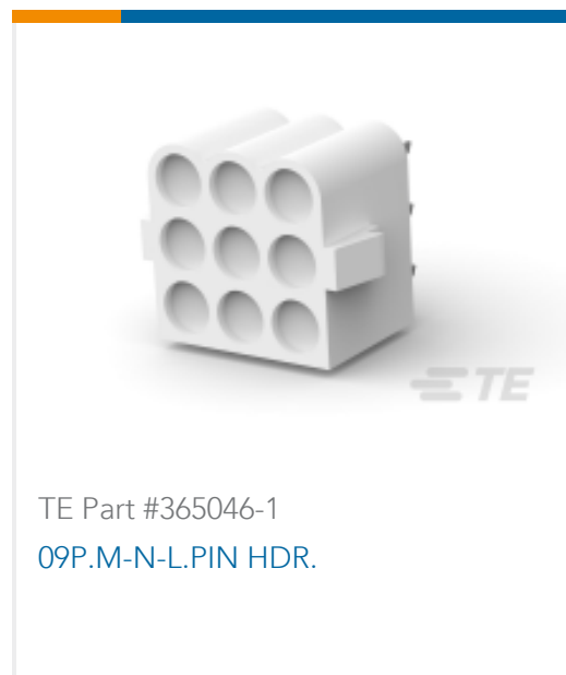
TE Part #365046-1 09P.M-N-L.PIN HDR.