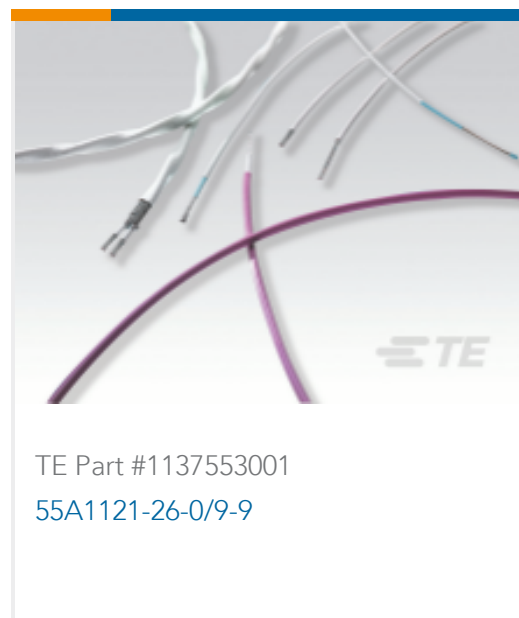
TE Part #1137553001 55A1121-26-0/9-9