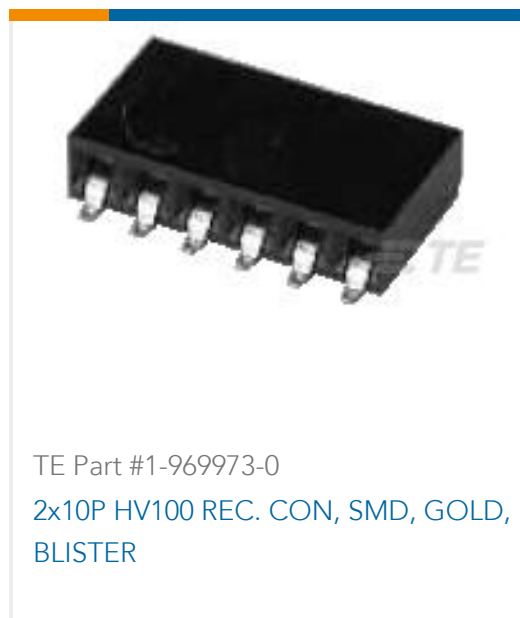
TE Part #1-969973-0 2x10P HV100 REC. CON, SMD, GOLD, BLISTER