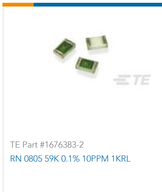
TE Part #1676383-2 RN 0805 59K 0.1% 10PPM 1KRL