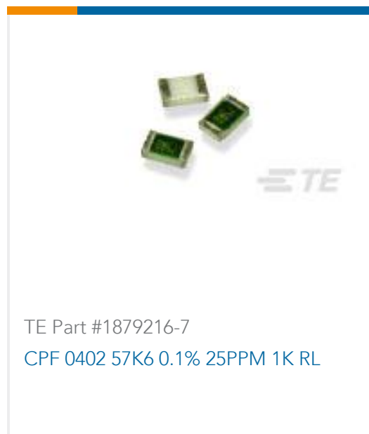
TE Part #1879216-7 CPF 0402 57K6 0.1% 25PPM 1K RL