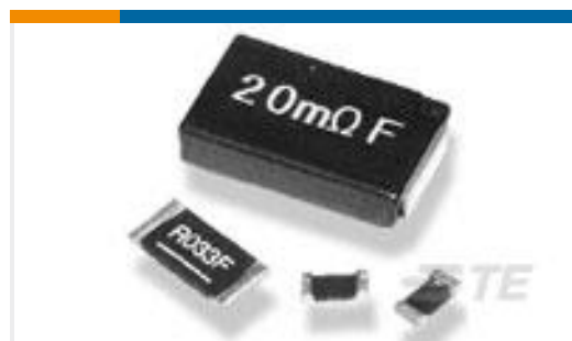
TE Part #4-1625827-0 TL3A R005 1% 2K RL