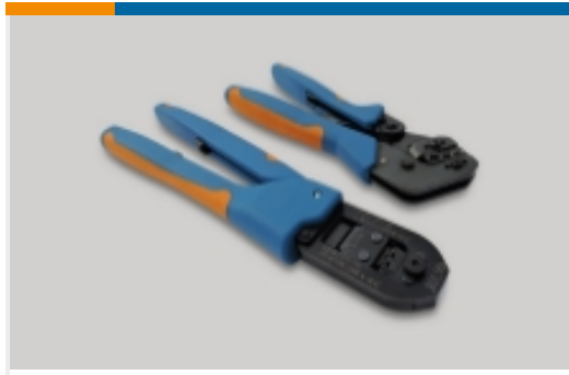
Hand Crimping Tools(4)