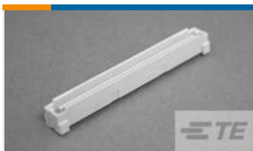
TE Part #1-5177986-4 0.8FH,P06H.5,100,08/Sn,TR,SC