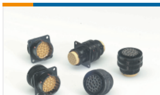
TE Part #ZPF00000000018724 FDBA 50H 14-12 PN-K