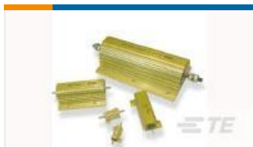
TE Part #7-1625971-5 HSA25 R01 5%