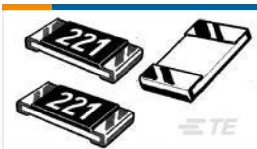
TE Part #2-1622820-1 3520 1R8 5%