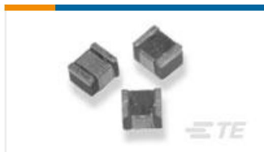
TE Part #6-1624113-2 3650 2A 0.56uH 5% 2K RL