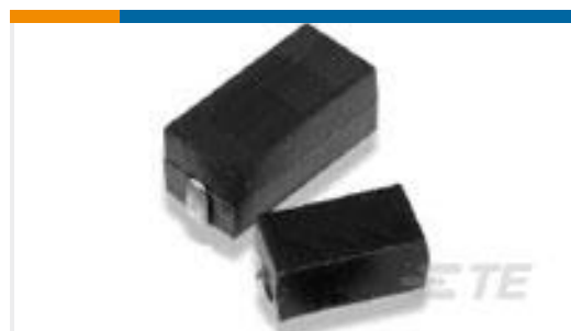
TE Part #5-1879022-1 SMF3 39K 5%