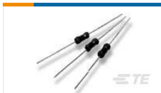
TE Part #7-1625890-8 2W SM M/OX 5% 390K