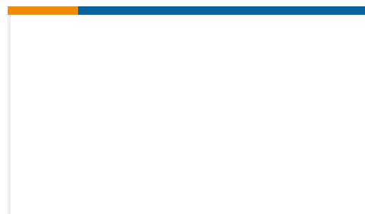
TE Part #ATM396-18 AS-18 NUT PLATE