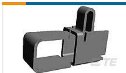
TE Part #1827625-1 SHIELD FINGER 3014 ANTI OVER STRESS TYPE