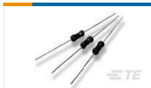
TE Part #8-1625890-2 2W SM M/OX 5% 560K