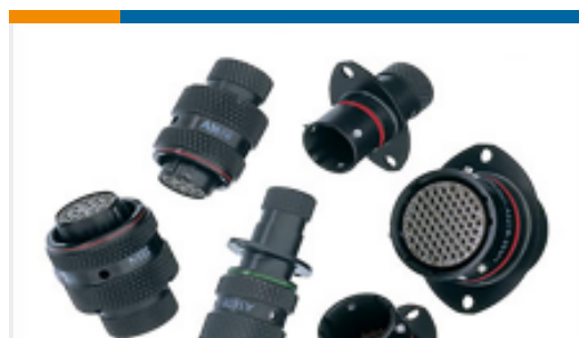
TE Part #AS120-35PN RECEPT.CABLE COUP.TYPE 1