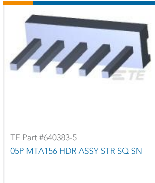
TE Part #640383-5 05P MTA156 HDR ASSY STR SQ SN