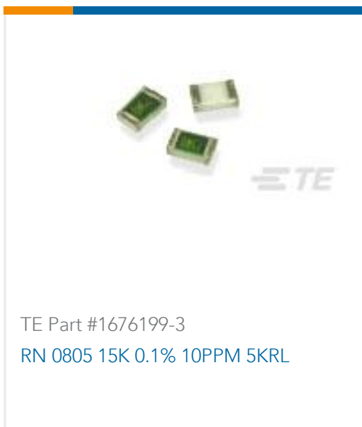
TE Part #1676199-3 RN 0805 15K 0.1% 10PPM 5KRL