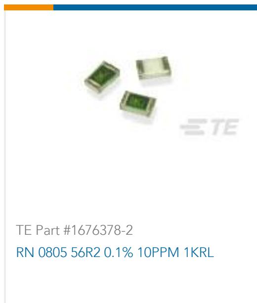
TE Part #1676378-2 RN 0805 56R2 0.1% 10PPM 1KRL