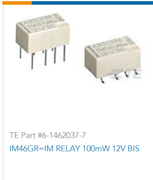
TE Part #6-1462037-7 IM46GR=IM RELAY 100mW 12V BIS