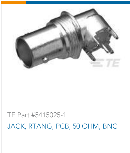
TE Part #5415025-1 JACK, RTANG, PCB, 50 OHM, BNC