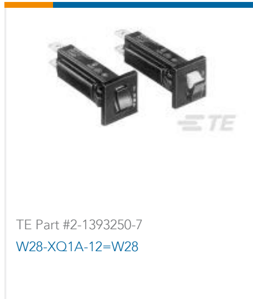
TE Part #2-1393250-7 W28-XQ1A-12=W28