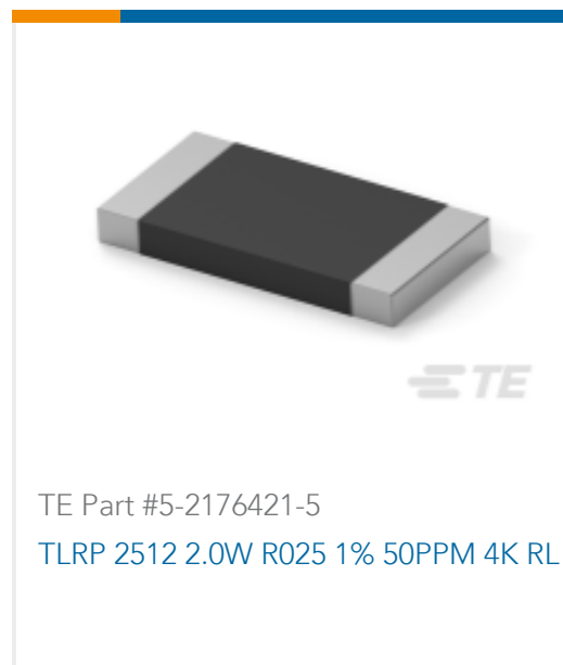
TE Part #5-2176421-5 TLRP 2512 2.0W R025 1% 50PPM 4K RL