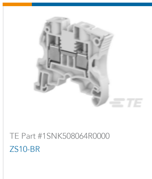
TE Part #1SNK508064R0000 ZS10-BR