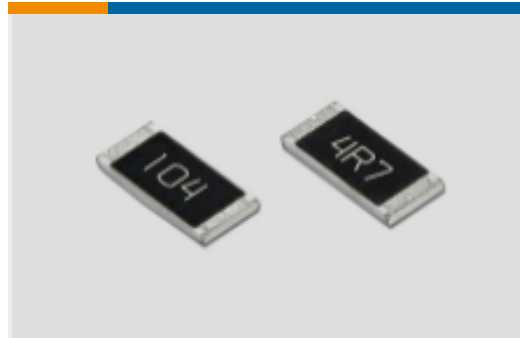
Surface Mount Resistors(56)