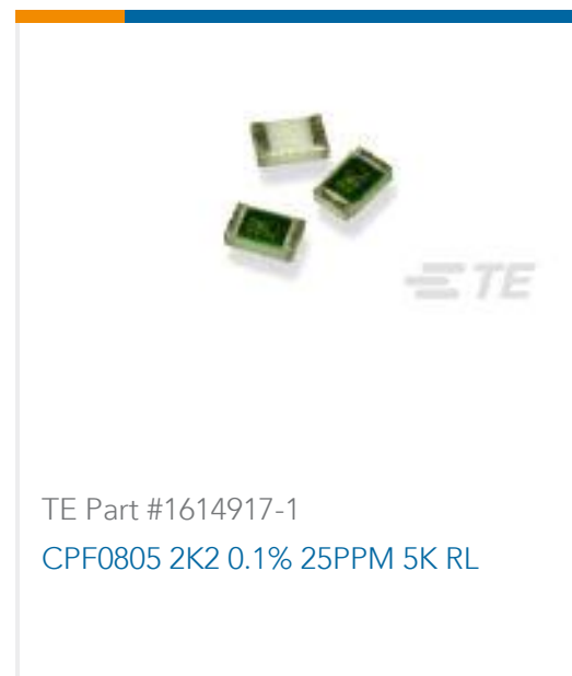
TE Part #1614917-1 CPF0805 2K2 0.1% 25PPM 5K RL