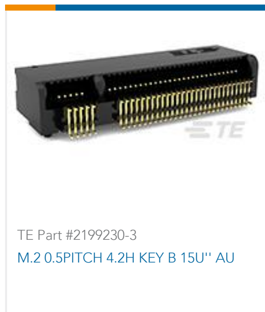
TE Part #2199230-3 M.2 0.5PITCH 4.2H KEY B 15U" AU