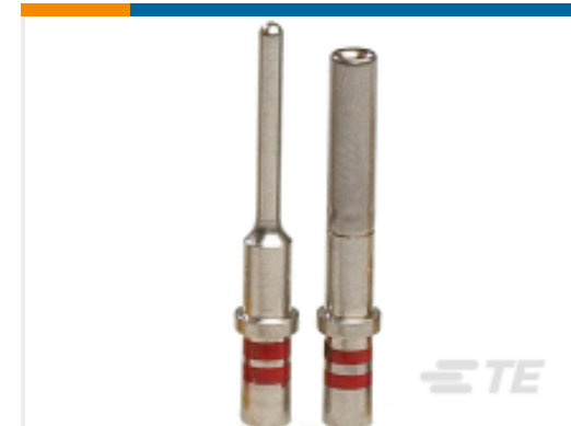
TE Part #ZPF000000000001261 097-0267-16 A1267