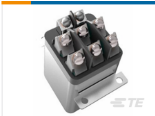
TE Part #1617807-5 FC-335-SY8= RELAY, 3PST