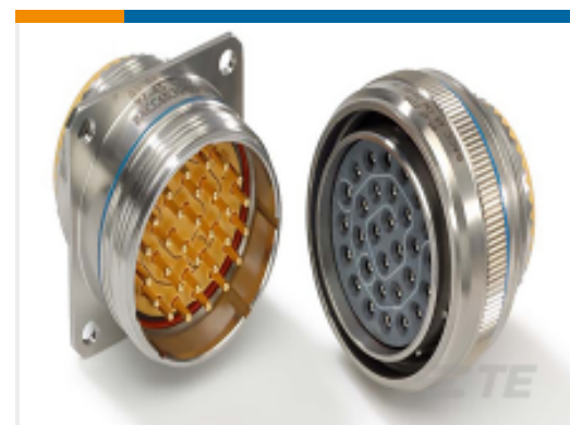
TE Part #ZPF0000000000007174 983-ORS 08-98 PN