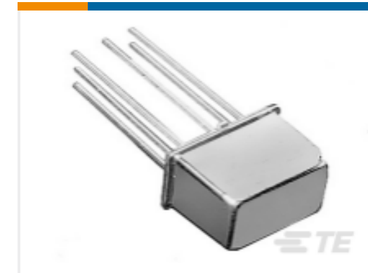
TE Part #1617147-5 JMGAP-26P = M39016/17-030P