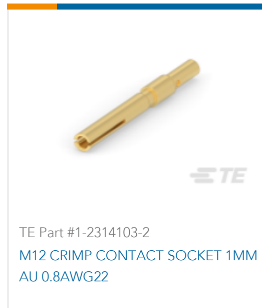
TE Part #1-2314103-2 M12 CRIMP CONTACT SOCKET 1MM AU 0.8AWG22