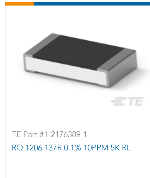
TE Part #1-2176389-1 RQ 1206 137R 0.1% 10PPM 5K RL