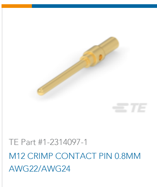
TE Part #1-2314097-1 M12 CRIMP CONTACT PIN 0.8MM AWG22/AWG24