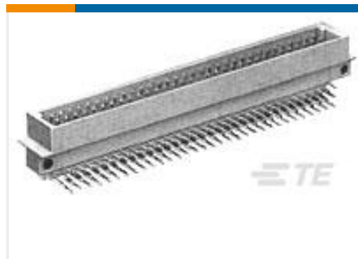
TE Part #216432-4 64P.IEC-C MALE CONN