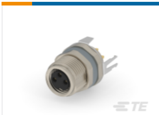
TE Part #T4041037031-000 M8.FMLE.PNLREAR.3POS.STR PCBSHLD