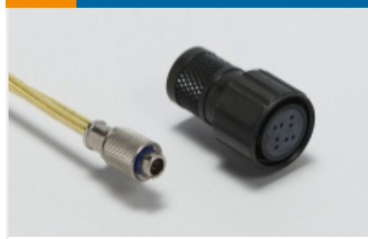
Standard Circular Connectors(519)