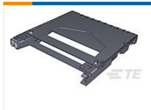
TE Part #1939115-1 SD CONN STD EMBOSS W/B REVERSE