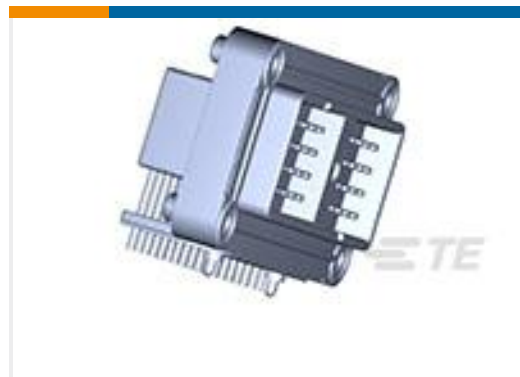
TE Part #DRC13-40PA-CG01 HDR, 40P, BLK, RA, M5 FLG, SN/NI /CU, A