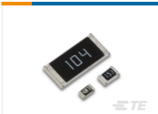
TE Part #2-2176345-4 CRGCO 1210 820R 1%