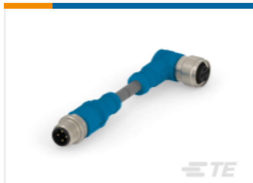
TE Part #T4162124004-002 RPC-M12-4MS-1.0SH-M12-4FR-PUR