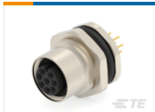
TE Part #T4141012081-000 M12,REAR MOUNT,FEMALE,A,8P, SOLDER PCB