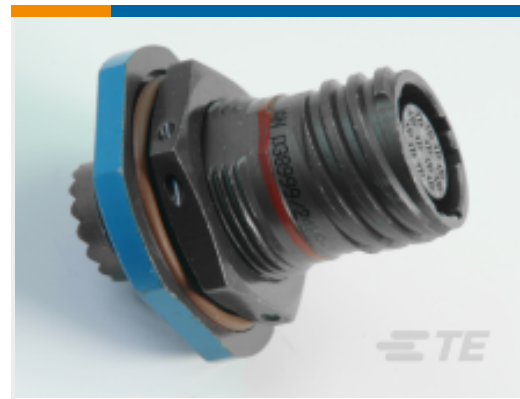
TE Part # CAT-D38999-DTS16D Jam Nut: D38999, 25-20 Insert