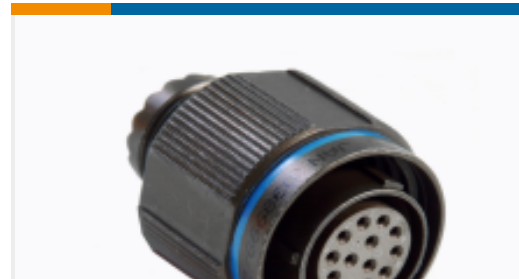
TE Part #YDTS26W25-20PNV001 PLUG ASSY