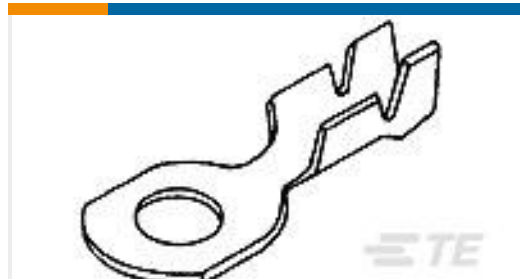
TE Part #60123-2 RING 160 CRIMP TAB 26-20 AWG TPBR