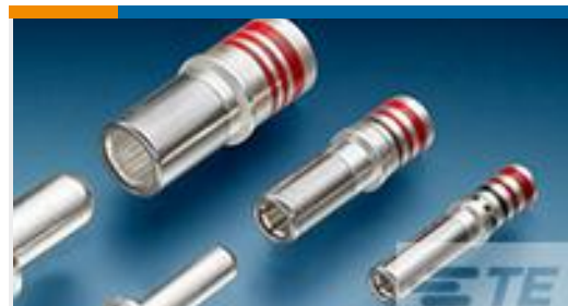
TE Part #0662-207-0082 CONT SOC ASSY