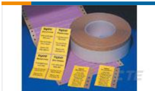
TE Part #174018-000 NPVF050GN-100