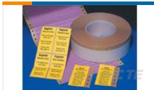
TE Part #044782-000 NPVF050VT-100