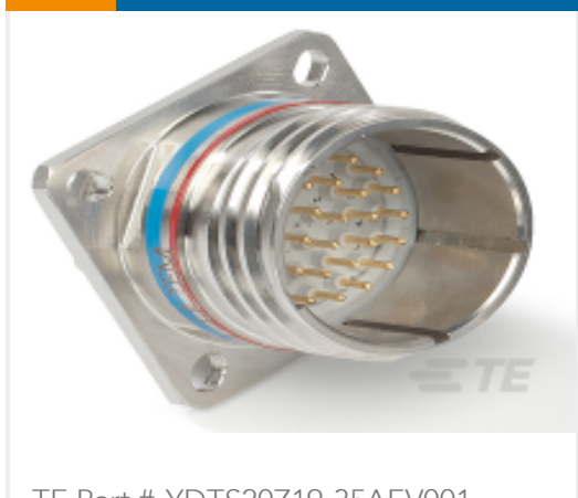
TE Part # YDTS20Z19-35AEV001 RECP ASSY