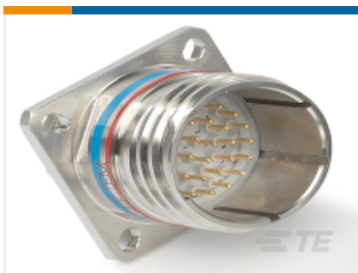
TE Part # CAT-D38999-DTS8X D38999: Square Flange, 21-35 insert