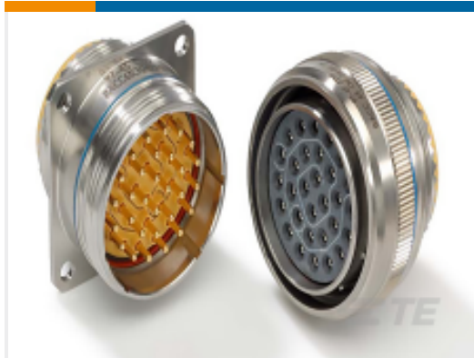
TE Part #ZPF000000000007383 983-0S 16-10 SN