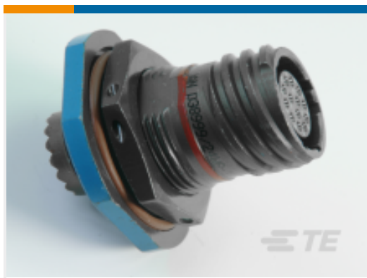
TE Part #YDTS24W25-43SAV001 RECP ASSY