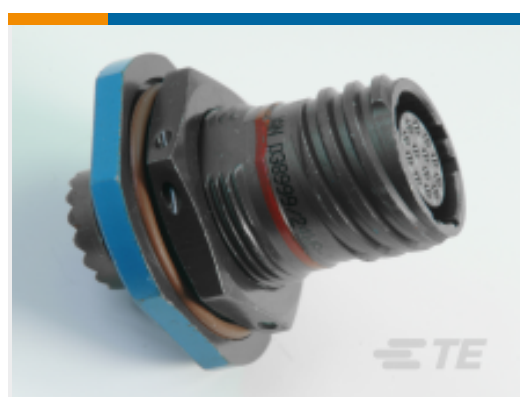
TE Part # YDTS24Z11-35ADV001 RECP ASSY