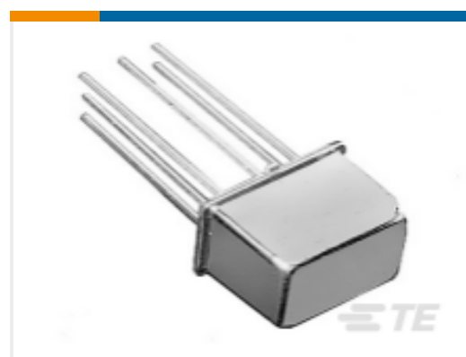
TE Part #1617147-5 JMGAP-26P = M39016/17-030P