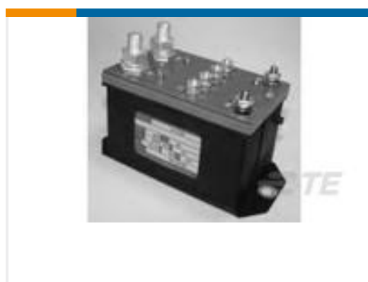
TE Part #1616058-6 A703CD (FAA/PMA)=RELAY